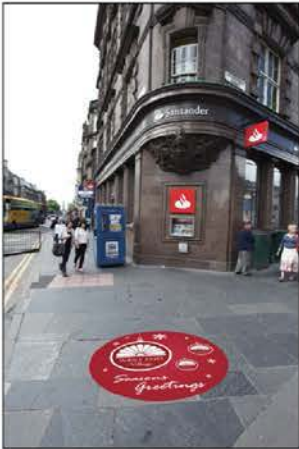
Photo mockup of installed treadable roundels.

Also highly reflective stickers of the same design to be installed in shop windows in the west end.