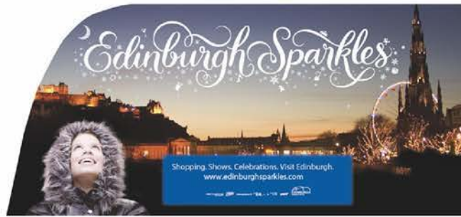
Tram Mockup Vinyl at Edinburgh Airport