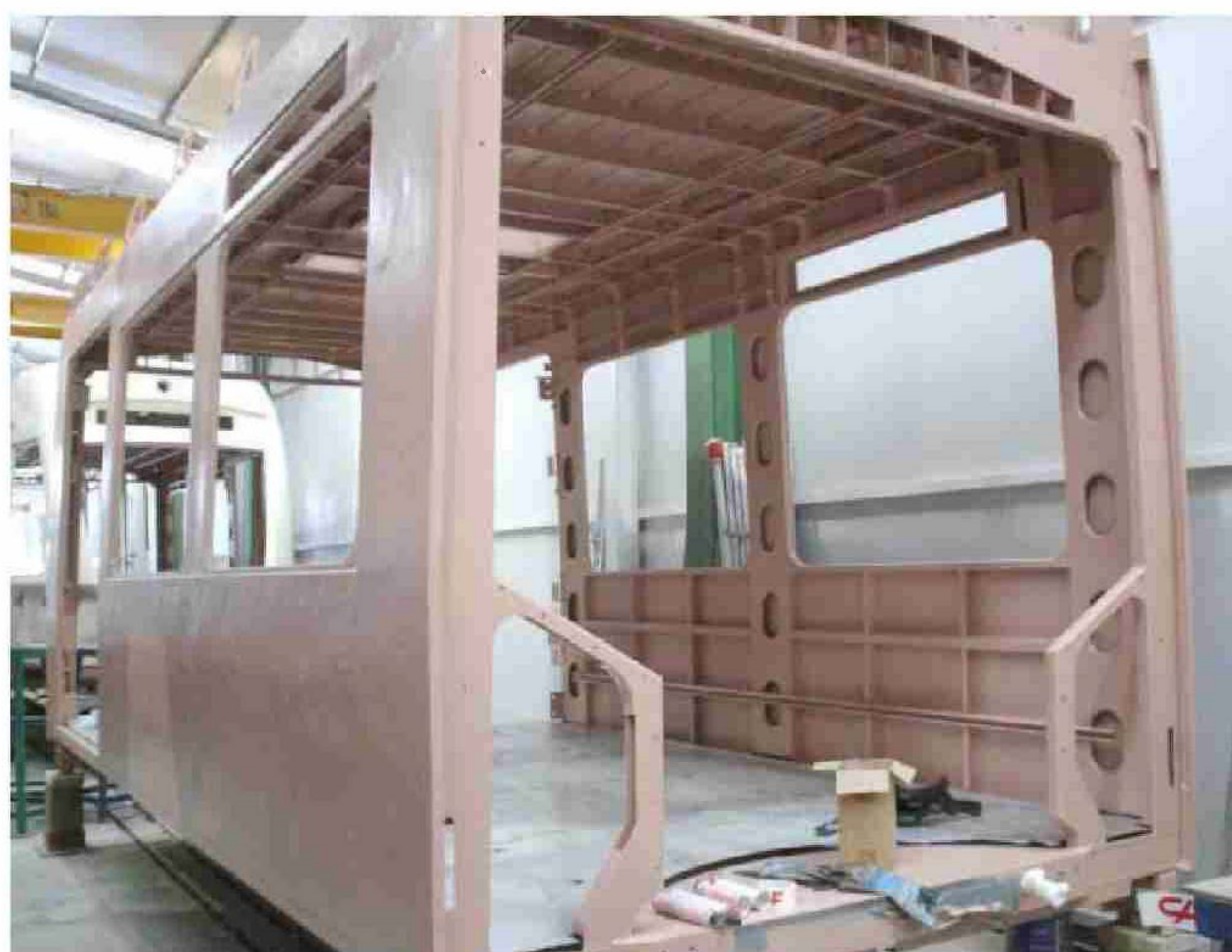
D-3 Bodyshell primed