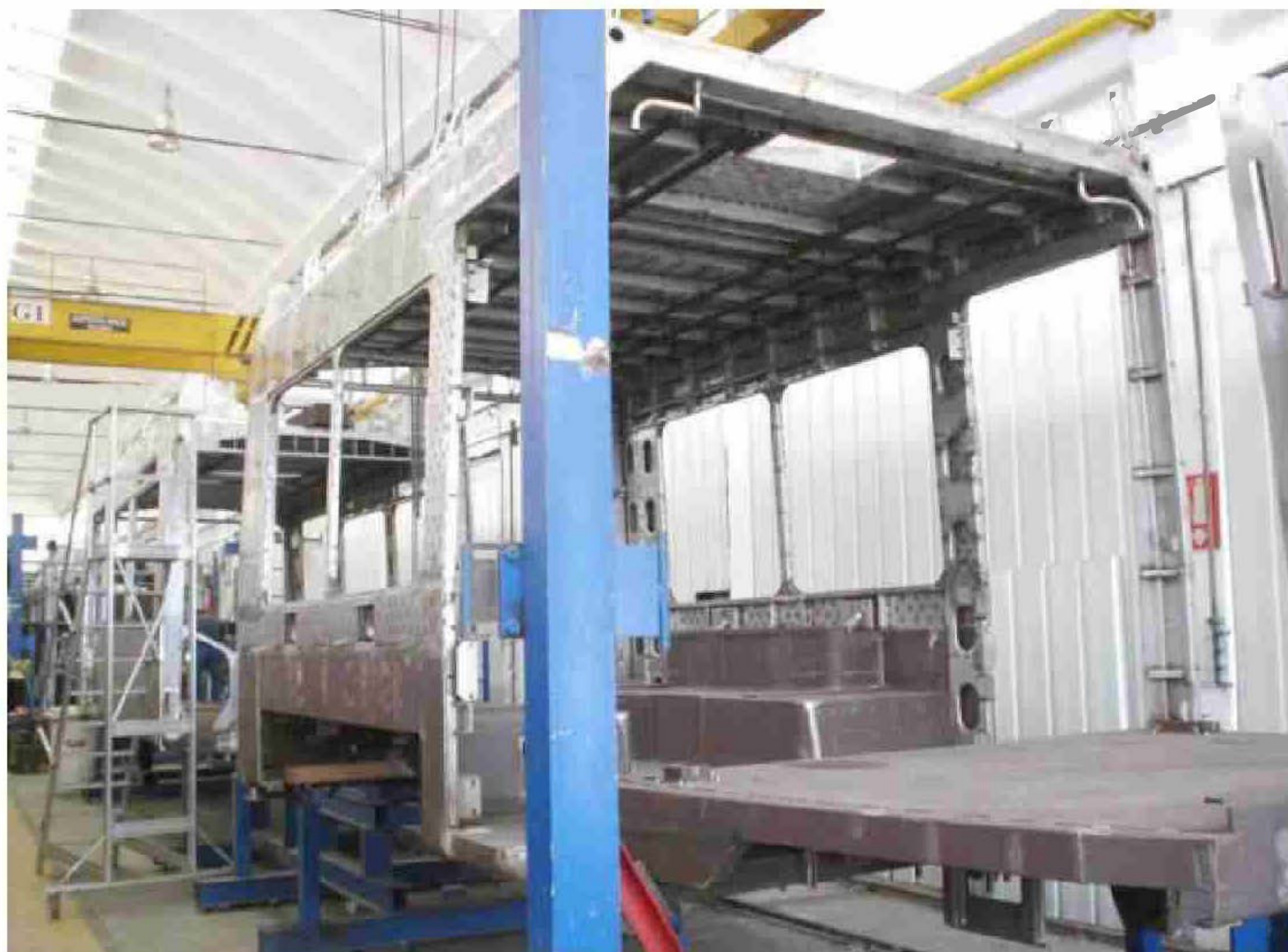
A-6 Bodyshell in the measurement jig